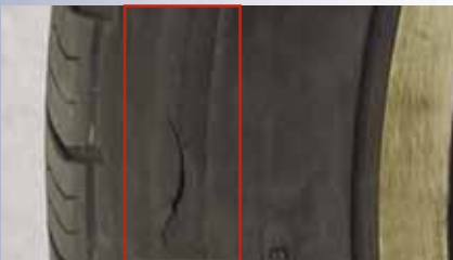
Tires with cuts, cracks or bulges in the sidewall or tread should be replaced.