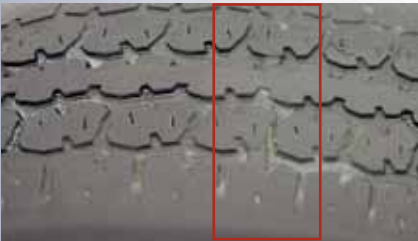
A tire must be replaced when the tread wears even with the tread wear indicator.