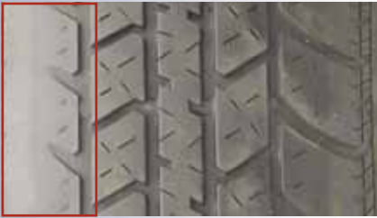
Uneven tread wear can be caused by improper wheel alignment or a tire imbalance.

Tires with deep cuts, slits, cracks, blisters or bulges are potentially dangerous and should be replaced. Tires with treads worn down to the same level as the tread wear indicator (1.5 mm or \frac{2}{32} of an inch in depth) must be replaced.